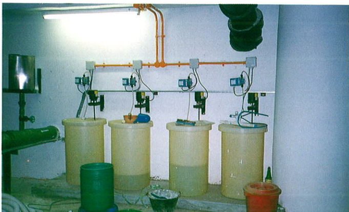
CHEMICAL DOSING SYSTEM

SCOTTSCENTER PTE LTD 2A SECOND CHIN BEE ROAD SINGAPORE 618781 TEL: 68614077 FAX: 68619556 EMAIL: spl@scotts.com.sg